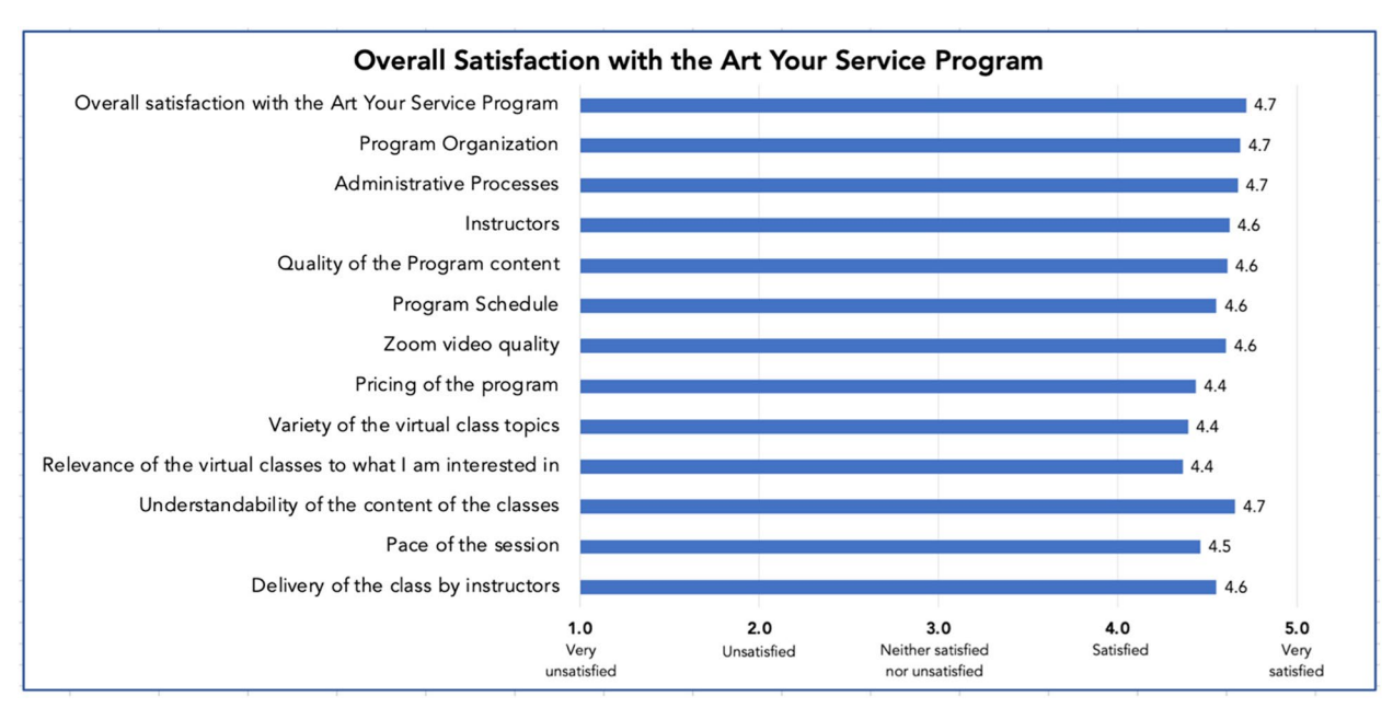
Fig. 3 Overall satisfaction with the AYS program

Sutherland et al. BMC Public Health (2024) 24:1232 Page 10 of 13