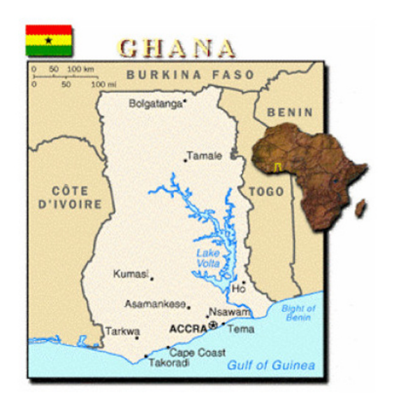
Figure I Map of Ghana.

prevalence rates as high as 33% in some communities [3,4]. The increasing prevalence of hypertension is well reflected in the increasing stroke and cardiovascular disease morbidity and mortality [7-9].